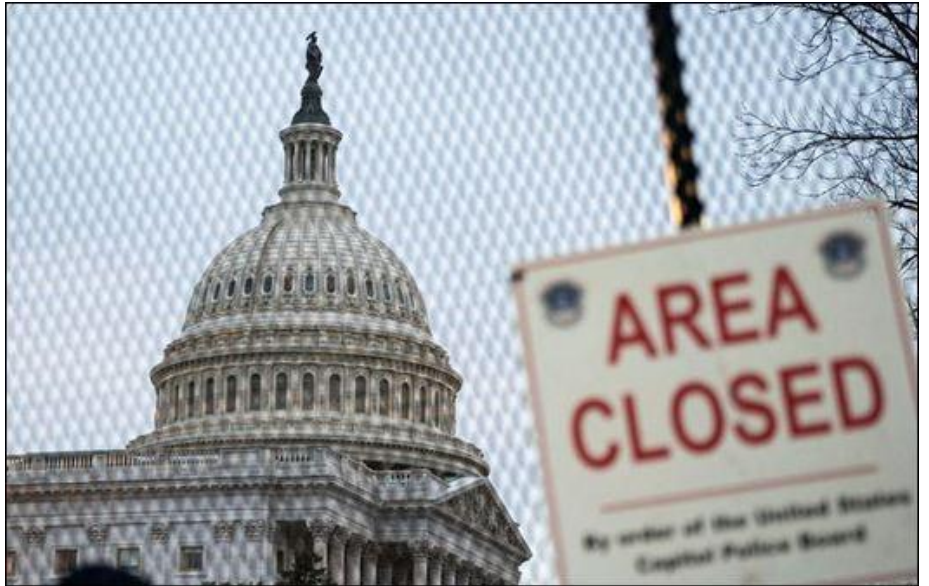
TCCR Screen Shots