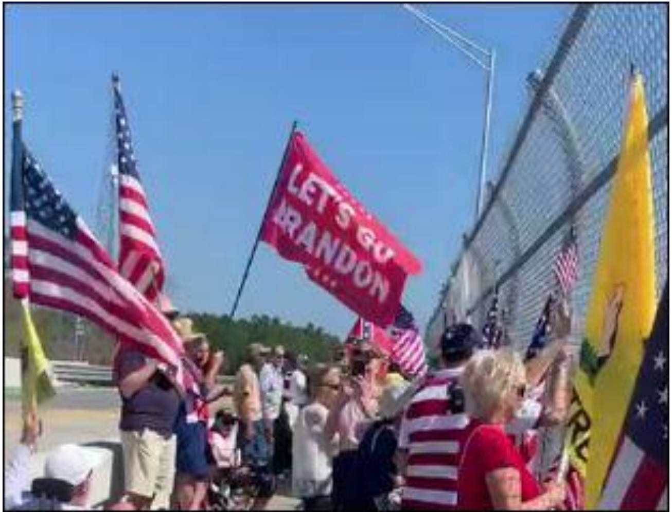
TCCR Screen Shot images